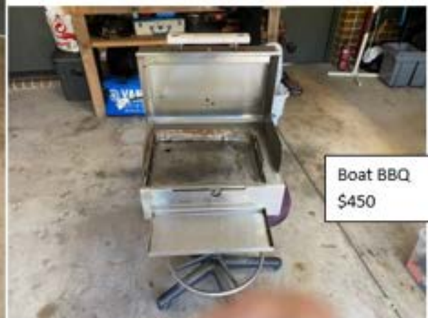
Boat BBQ $450