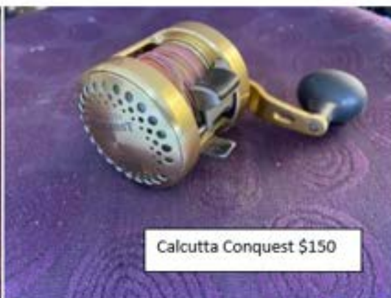
Calcutta Conquest $150