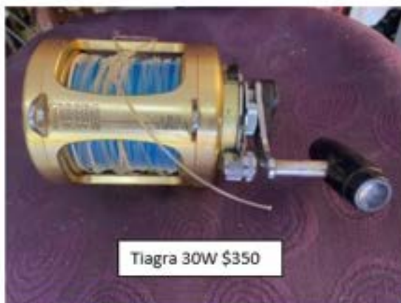
Tiagra 30W $350