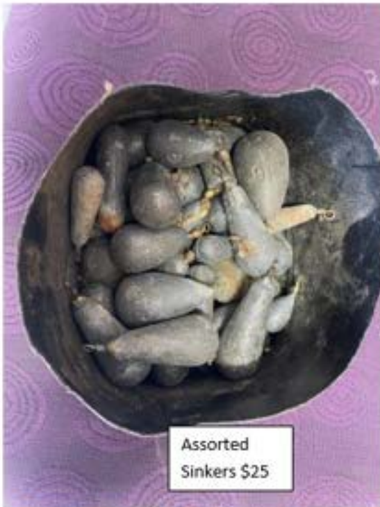
Assorted Sinkers $25