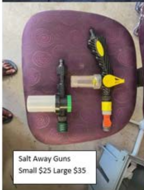
Salt Away Guns Small $25 Large $35