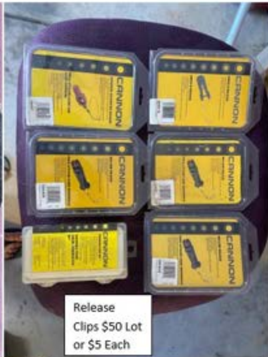
Release Clips $50 Lot or $5 Each