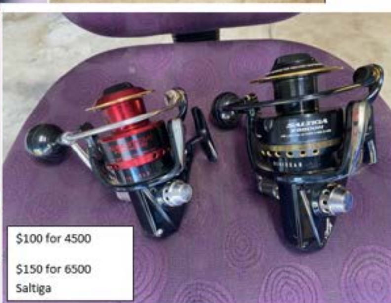
$100 for 4500 $150 for 6500 Saltiga