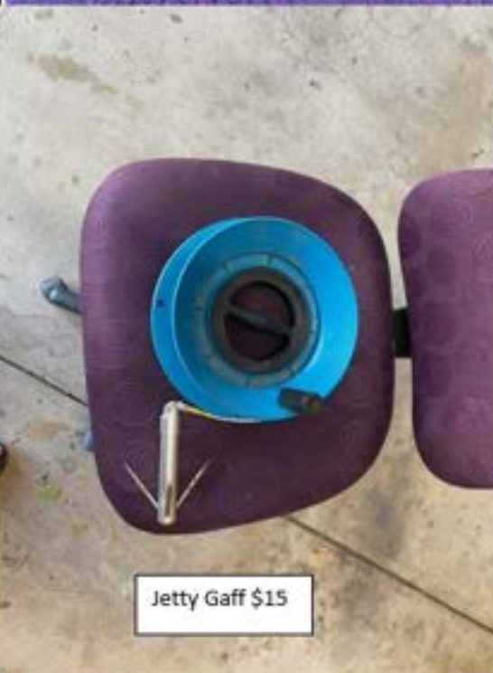
Jetty Gaff $15