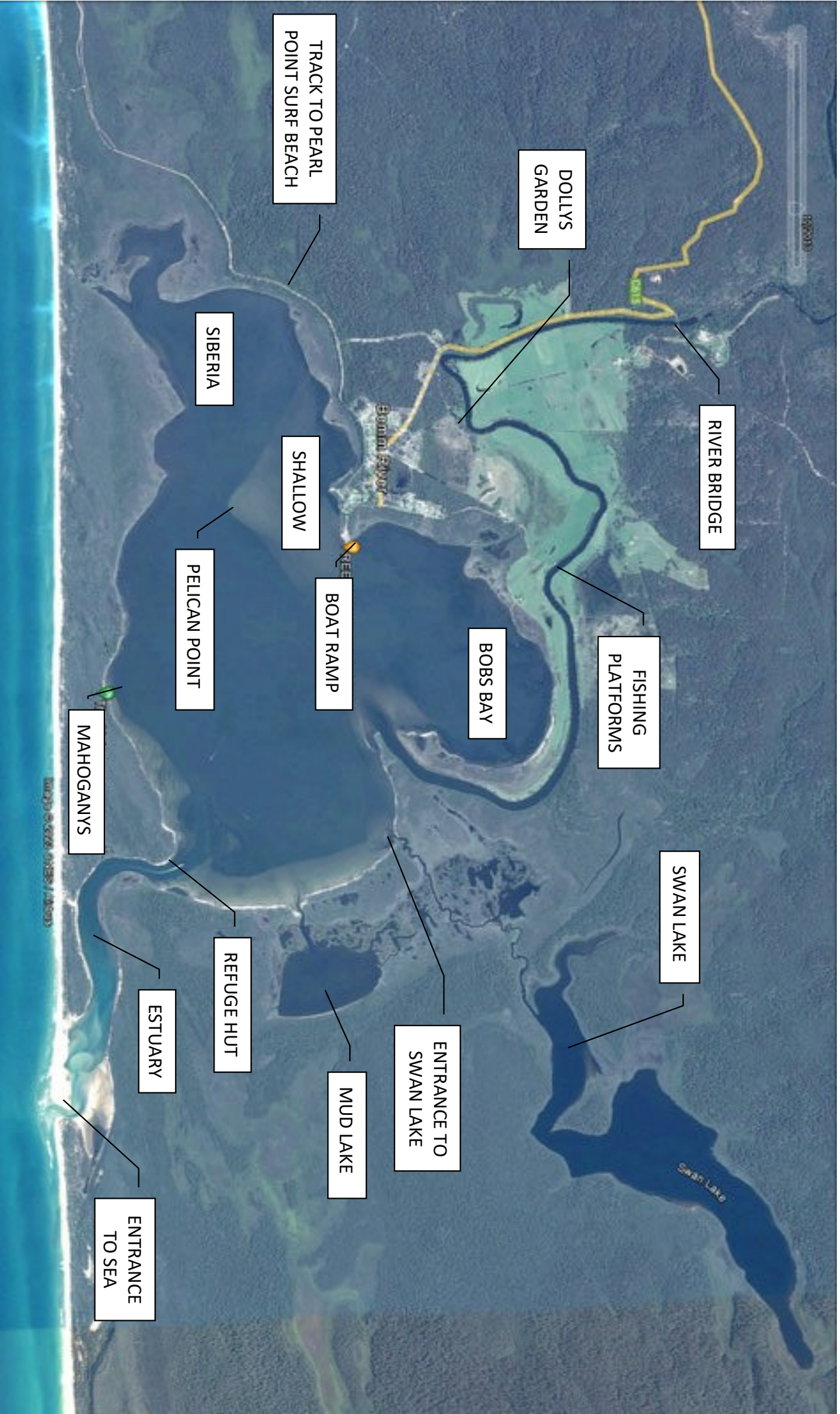
BEMM RIVER - SYDENHAM INLET - FISHING MAP